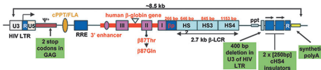
Figure 3. Diagram of the HPV569 \beta -globin ( \beta^A -T87Q) lentiviral vector. The 3’ \beta -globin enhancer, the 372 bp IVS2 deletion, the \beta^A -T87Q mutation (ACA[Thr] to CAG[Gln]), and DNase I hypersensitive sites (HS) 2, HS3, and HS4 of the human \beta -globin locus control region (LCR) are indicated. Safety modifications, including the 2 stop codons in the \psi^+ packaging signal, the 400 bp deletion in the U3 of the right HIV LTR, the rabbit \beta -globin polyA signal, and the 2 \times 250 bp cHS4 chromatin insulators, are indicated. In the BB305 lentiviral vector, U3 promoter/enhancer has been replaced by cytomegalovirus (CMV) promoter/enhancer and the 2 \times 250 bp cHS4 insulator elements have been removed. CPPT/flap, central polypurine tract; HIV LTR, human immunodeficiency type-1 virus long terminal repeat; ppt, polypurine tract; RRE, Rev-responsive element; \beta p, human \beta -globin promoter.

To prepare for human clinical trials, safety modifications were made to the original vector, as follows, to yield the vector referred to as HPV569. 109,112 These include mutating the GAG gene and deletion of the viral enhancer and promoter elements in the U3 region of the 3’LTR to generate a SIN vector (Fig. 3). The SIN modification reduces the likelihood of propagation of replication-competent recombinant LV in the vector producer and target cells, 105,131 decreases the risk of mobilization of the vector genome upon HIV secondary infection, 132 and reduces the residual activation of cellular oncogenes by enhancer/promoter activities of integrated LTRs. 133,134 Another modification has concerned the U5 region of the 3’LTR, which was replaced by an artificial polyadenylation/termination signal derived from the rabbit \beta -globin gene. 135 This latter modification yielded higher viral titers for the SIN versions of the HPV569 vector because of more efficient polyadenylation/termination of the viral transcript. 136 In an effort to protect transduced cells