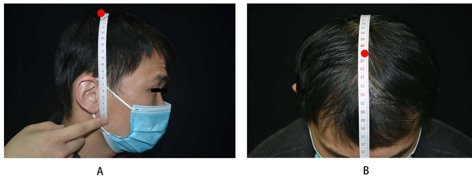
Figure 1 The selected location of the hair trichoscope.

Note: *The red point shows (A) the line connecting bilateral ear canal openings; (B) the midline of the head.