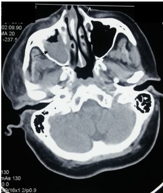
Figure 5 Computed tomography of paranasal sinuses showing right maxillary sinusitis with spread of inflammation to infratemporal fossa.

Abbreviation: ESR, erythrocyte sedimentation rate.