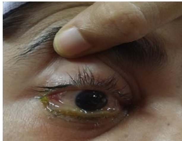
Figure 2 Chemosis, proptosis and ophthalmoplegia of right eye.