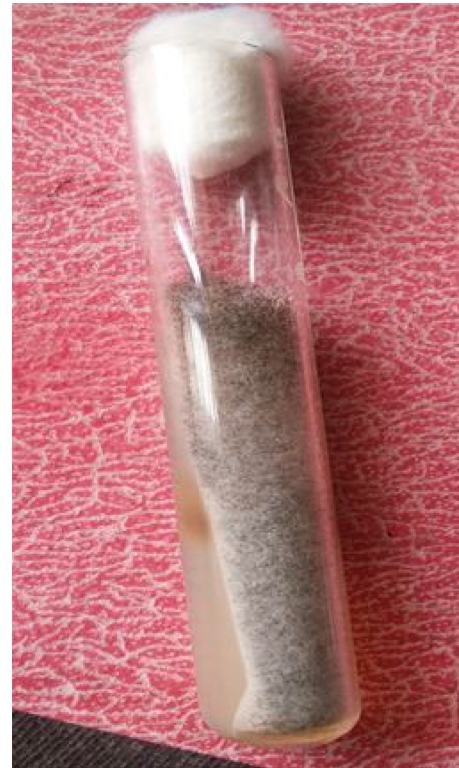
Figure 6 Rhizopus growth in Sabouraud's dextrose agar.

She was treated with intravenous liposomal amphotericin B, posaconazole, and timely endoscopic nasal debridements. Blood sugar was controlled with insulin. She improved symptomatically after 6 weeks of treatment, as evidenced