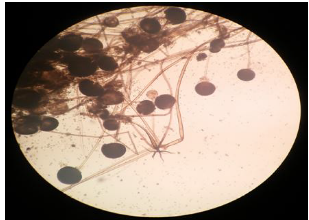
Figure 7 Filamentous branching aseptate hyphae with sporangia. Note: Magnification: 40×.