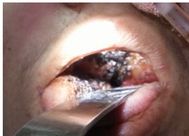
Figure 4 Black eschar with erosion of the hard palate on the right side.

sensorimotor system was normal. There were neither cerebellar signs (dysdiadochokinesia, dysmetria, dyssynergia) nor signs of meningeal irritation. Involvement of more than seven cranial nerves on the same side in the absence of raised intracranial tension and sensorimotor signs is called Garcin