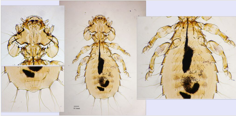
Figure 2. doi

Nymph of Dennyus sp.; upper left: Head; lower left: Genital region; right side: close up to the body; the scale bar is only applicable to the full body image.