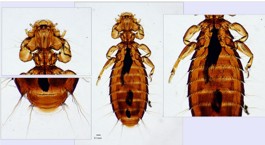
Figure 3. doi

Head trilobed triangular in shape, maxillary palp protruding out of the head, antenna very short, temple rectangular with characteristic highly chitinized out line, gula well developed with lateral row of four black spin-like seta and characteristic chitinization surrounding; thorax clearly divided, prothorax small quadrat shape, meso and meta thorax highly chitinized on lateral margin with acute ends; fore legs with large coxa and enlarged rounded femora, mid and hind legs slightly equal in length, ventral side of hind femora covered with elongated brush of short seta; abdomen elongated oval in shape with highly chitinized lateral margin with acute ends and two small thorn-like seta, the ventral brush appears in segment IV and V; the body of this species is highly pigmented (Fig. 3).