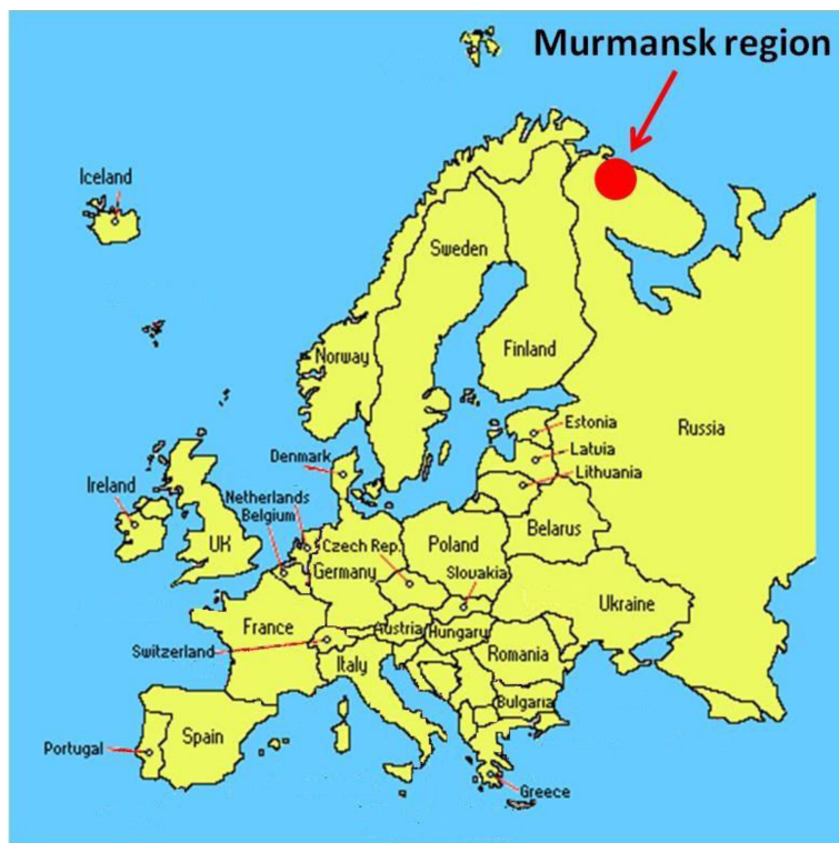
Fig. 1. Murmansk region in the northwest Russia.

habits (8). Earlier consistent evidence emphasized that even non-smokers may develop chronic airflow obstruction (9,10). Inhalational exposures such as occupational dusts and chemicals are harmful environmental contaminants (11). The Murmansk region includes areas where its inhabitants are exposed to contaminants from mining industries. The prevalence of smoking (12) and COPD (13) is high in Russia, though the simple statistics probably do not reflect the scale of the problem in this region. There is an urgent need to investigate the persistence of chronic cough/phlegm symptoms by using specific questions about their predictors, onset and duration.