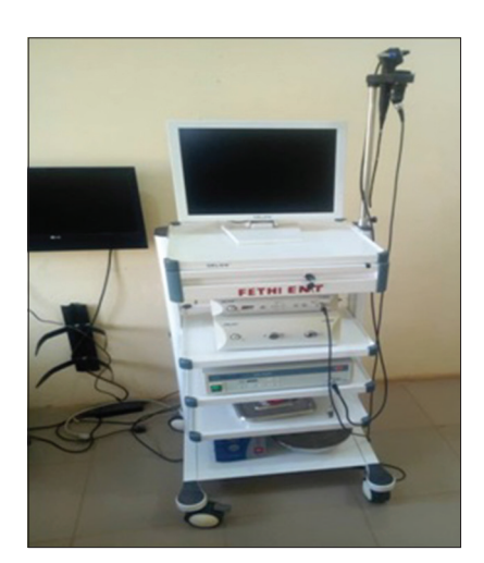
Figure 1: Xion Flexible Fiber-optic nasopharyngolaryngoscope with video monitoring

hoarseness (26.0%), epistaxis (6.0%), and foreign body (5.0%). Most of the patients who had the procedure done had normal findings (59.0%) [Table 3]. Nasal mass was seen in 15.0%, bilateral vocal cord nodules (5.0%), sloughs over the oropharynx and epiglottis in 6.0%, laryngeal tumor in 4.0%, and right atrophic vocal cord in 2.0%. Table 4 illustrated the indications distributed by gender. There was a statistically significant relationship