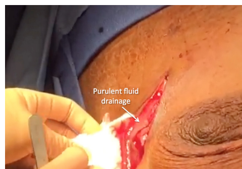
Figure 3 Still image from the video recording during device explantation. More than 200 cm 3 of purulent fluid was drained upon incision of the device pocket site.

Without transvenous leads, S-ICDs offer potential advantages over TV-ICD with respect to possibly decreased risks of intravascular and systemic infections, lead dislodgment, and transvenous lead implantation-associated complications