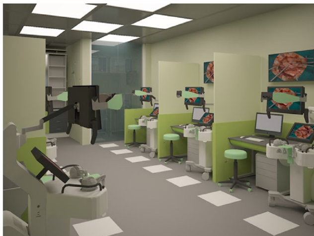
Figure 1: Prototype for a surgical simulation training center incorporating intelligent training systems. Trainees can practice a simulated procedure on the virtual reality platforms and obtain individualized feedback displayed on the monitor above each station. Simulators are arranged with sufficient space to maintain social distancing while limiting distraction. The figure was produced by Dr. Mostafa Sabbagh and Manal Al-Tahawi who have granted the co-authors permission of use.