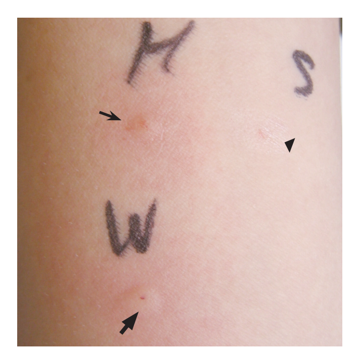
Fig. 1. Prick to prick test for walnuts. The positive control was histamine (4 \times 4 \text{ mm}, \text{ arrow}) , and negative control was normal saline (0 \times 0 \text{ mm}, \text{ arrow head}) . Prick to prick test for walnuts was positive (6 \times 5 \text{ mm}, \text{ bold arrow}) .

In oral challenge test for walnuts of 15 g, he tolerated except of oral itching, which showed that he had an oral allergy syndrome to walnuts. Exercise provocation test, free running for 10 min, was done on the other day and the result was negative. On another day, he took walnuts of 15 g and proceeded to free running for 10 min outside after 2 h. Only a few hives on neck and elbow were seen 2 h later. Although a diagnosis of food-dependent exercise-induced mild urticaria was established, anaphylactic events did not occur. We noticed that this food-exercise challenge was done in a cold environment (temperature of about –2°C), but prior events were induced in a warm environment (temperature of about 26°C). Oral food challenge test and exercise provocation test performed independently in a warm environment were negative. So he took 10 min exercise 2 h after walnut ingestion in a warm environment.