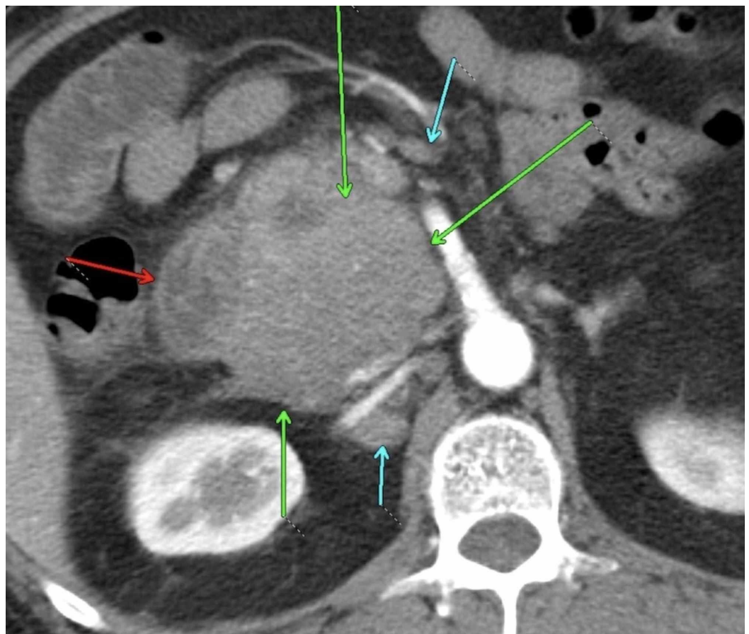
FIGURE 1: Contrast enhanced axial image through the abdomen shows homogenous confluent mass at the

On physical examination, his vital signs were normal, and he had tenderness on palpation at the epigastric area without signs of peritonitis. Complete blood counts were within normal limits. He had transaminitis and elevated total bilirubin and alkaline phosphatase. Serum amylase and lipase were 123 IU/L (normal: 13-53) and 864 IU/L (normal: 13-60), respectively. Tumor markers, including carbohydrate antigen (CA 19.9), carcinoembryonic antigen (CEA), and alpha-fetoprotein (AFP) were normal. MRI of the pancreas showed a large mass at the pancreatic head measuring 8.3 cm x 7.6 cm in maximum diameter with peripancreatic and retroperitoneal adenopathy (Figure 1). Endoscopic ultrasound demonstrated the mass in the pancreatic head and malignant-appearing peripancreatic lymph nodes. CT guided biopsy of the pancreatic mass was performed. Pathology revealed a high-grade B-cell lymphoma (Figures 2-3). Bone marrow biopsy did not show atypical cells. Staging CT scans revealed a 9 mm sized mediastinal node.