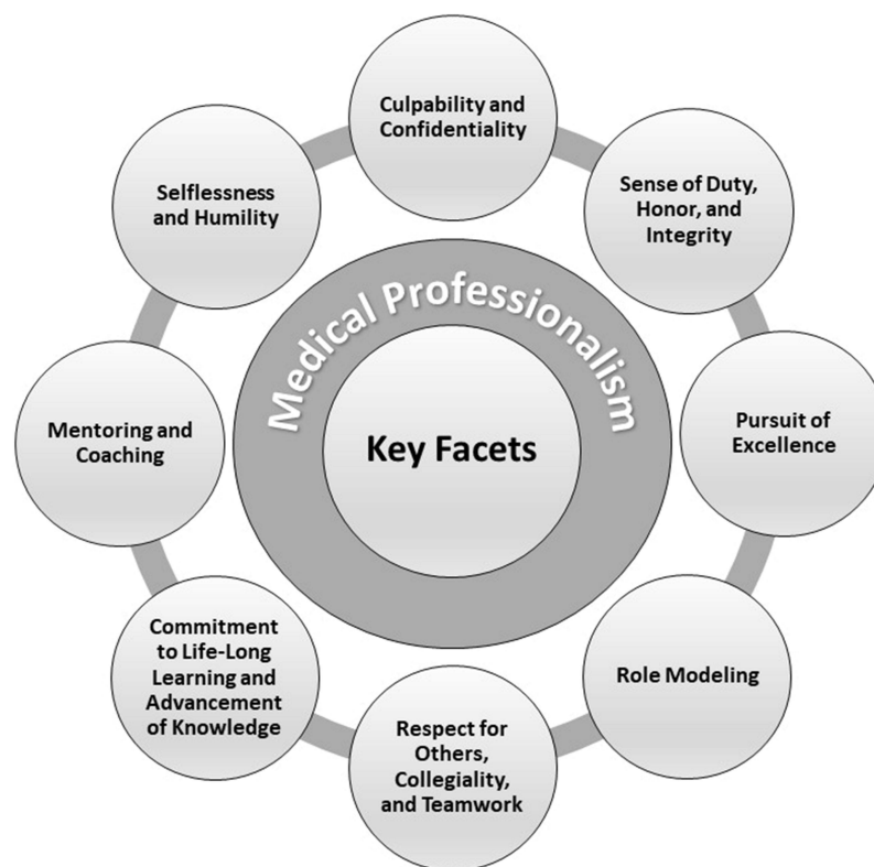
Figure 1 Key facets of medical professionalism.

Some institutions have further enhanced this thematic paradigm by building a culture of “safety” that safeguards psychological wellbeing and nurtures trust among key team members and stakeholders. The Vanderbilt Center for Patient and Professional Advocacy established in 1989 has developed a stepwise iterative process shifting from reactive crisis management triggered by poor patient outcomes to preventive measures by preemptively identifying clinicians at risk for developing unprofessional behaviors and by pursuing professional accountability with well thought-out action-oriented systems. 18,19 The critical facets of professionalism have been further refined to include effective communication, availability, teamwork, self-awareness, respect, and technical and cognitive competence. 18