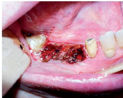
Fig. 2. Oral leukoplakia of the gums (immediately after the surgical treatment with CO 2 laser).