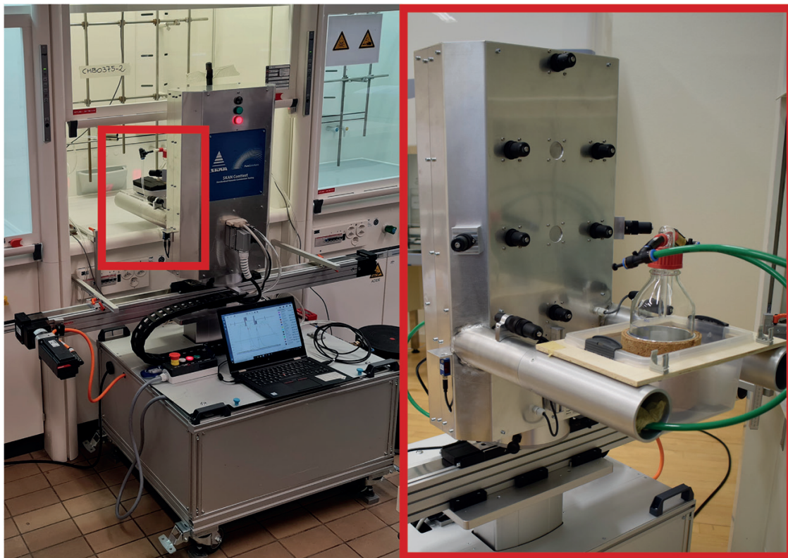
Figure 1. A Contest test setup under field conditions (photograph by courtesy of EPFL, CH-Lausanne), at left. View on front side of the body with sensors (black cartridges on the body), arms, and vaporizing bottle, at right.

extend 0.3 m through the sash opening (2) into the workspace at 0.05 m above work surface. They hold a glass bottle as obstruction.