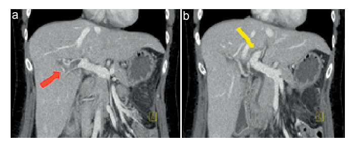
Fig. 2. a Intrahepatic thrombosis of the right portal branch after laparoscopic colectomy (red arrow). b The left portal branch is still patent (yellow arrow). Therapeutic anticoagulation was initiated.

Mechanical thrombectomy via a transhepatic or transjugular approach is another therapeutic option which is often applied in combination with local thrombolysis. It has the advantage of rapid removal of the thrombus in acute PVT. Initial recanalization rates are promising although the local vascular trauma may promote recurrent thrombosis [18, 22–24]. Surgical thrombectomy is performed only if the patient undergoes laparotomy for acute abdomen or intestinal ischaemia.