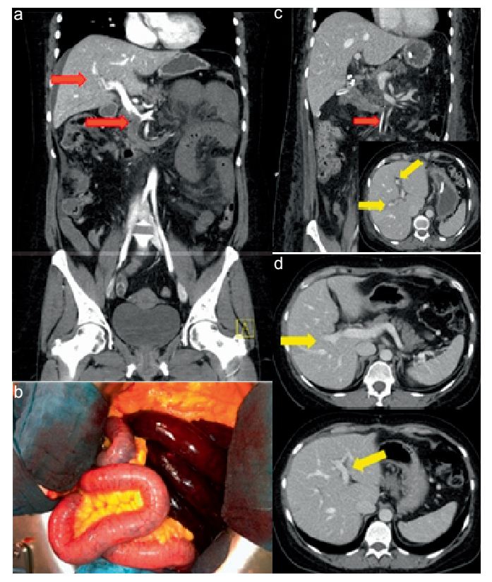
Fig. 3. Patient with acute MVT presenting with acute abdomen and bleeding from the proximal jejunum. a CT scan shows the MVT (red arrow) and partial thrombosis of the right intrahepatic portal branch. b Intraoperative evaluation of the bowel showed the need for bowel resection due to haemorrhage infarction of the proximal jejunum. In addition, a lysis catheter was inserted into the mesenteric vein. c CT scan 2 days after the initial operation showed the lysis catheter in the MV (red arrow) and confirmed patency of both intrahepatic portal branches (yellow arrows). d Patency of both intrahepatic portal branches at follow-up examination after 6 months (yellow arrows).

ate initiation of anticoagulation therapy is also recommended. Interventional thrombectomy and thrombolysis might be considered depending on the extent of thrombosis and the clinical presentation. However, evidence for the efficacy of thrombectomy and thrombolysis is limited to case reports and small retrospective series [21]. Finally, close clinical monitoring of patients with MVT, including assessment of symptoms, control of laboratory parameters, and, if necessary, repeated CT scans, is mandatory to identify those developing secondary bowel infarction.