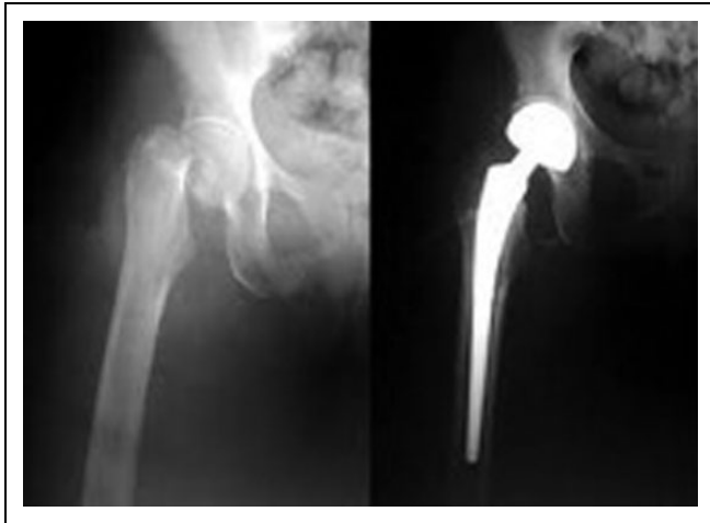
Figure 1. Radiographs of a Patient with Femoral Neck Fracture treated with Hemiarthroplasty.

daily geriatric care reduces in-hospital mortality and medical complications in older patients with hip fracture but has not been shown to reduce length of stay or functional recovery. 4,5 Previous studies have shown that accelerated discharge and home-based rehabilitation is associated with functional improvement, greater confidence in avoiding subsequent falls, improvements in health-related quality of life, and less caregiver burden. 6