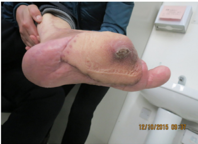
Fig. 8. Rupture occurs in early healing of pedicle.