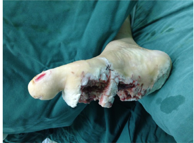
Fig. 1b. Pelma view of foot with large-area lateral bone defect.