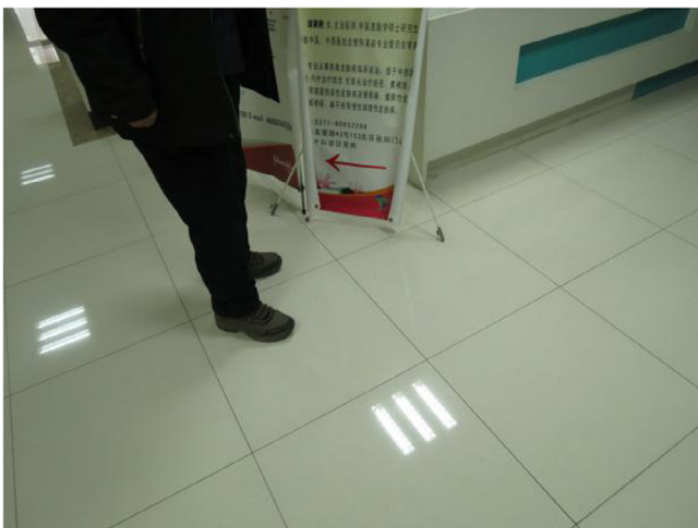
Fig. 9. Weight-bearing walking after 1 year.