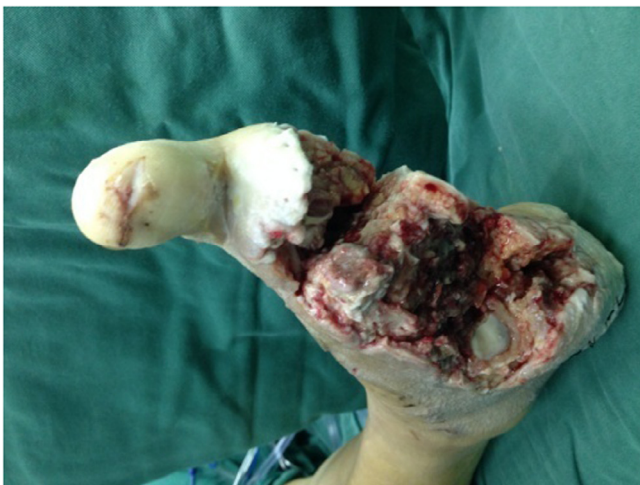
Fig. 1a. Dorsal view of forefoot with large-area lateral bone defect.

Vascularized fibular flap design is shown in Fig. 2. Ultrasound Doppler detection of lateral peroneal artery of contralateral calf was performed before the operation for skin perforation and marking. Flap and fibular length was designed based on dorsal wound surface with the marking point as the center. The flap area was 12 cm × 7 cm, and fibular length was 9 cm. Cut off appropriate length of lateral leg nervus cutaneus so that it remains in the flap.