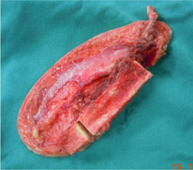
Fig. 3. Cut fibula flap.