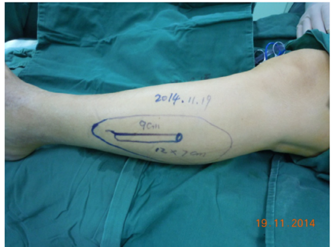
Fig. 2. Design vascularized fibular flap Fig. 3 cut fibular flap.

Find the peroneal artery, vein, peroneal artery perforation and fibular nutrition branch in the posteromedial fibula. Clamp the peroneal artery, vein, to facilitate foot blood supply. Cut off the required fibula with the swing saw according to the design line (Fig. 3), the free fibula shall carry a little muscular sleeve to protect the fibular blood vessel bundle. Dissociate appropriate length of the proximal and distal ends of the fibula arteries and veins to fit proximal and distal ends of descending branch of the dorsal and lateral circumflex femoral artery and vein, so that flow-through flap connecting free anterolateral femoral flap was formed.