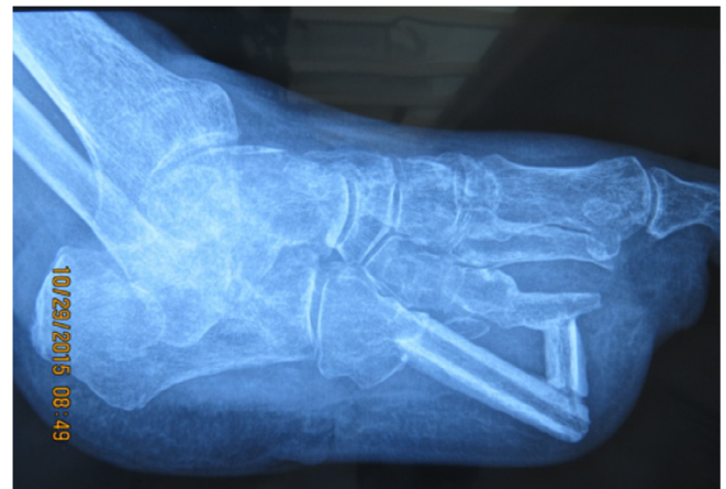
Fig. 6. Healing of bone graft.