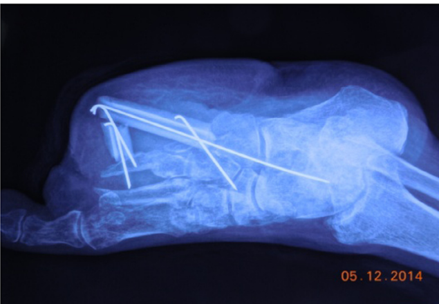
Fig. 5. Fixation of bone graft.

In this case, all the flaps survived. Callus growth can be seen 6 months after the fracture in postoperative x-ray review. Basic healing was achieved after 12 months, with right contraposition (Fig. 6). The transverse and longitudinal arch shape basically restored, with partial ability of weight-bearing walking restored. Sensory training began since the 2nd week after the tissue flap healing to promote sensory recovery of tissue flap. Deep foot pain sensory restored 3 months after the surgery, pain and part superficial sensory restored after 6 months; foot pain and tactile sensory restored 1 year after the surgery, with sporadic epicritic sensibility and sensory function at S3 level. Fractures underwent bone healing, foot shape was good, weight-bearing walking was practical, there was slight limp. The old patient had a heavy weight, and resumed job early after the surgery, walked a lot, so forefoot skin ulcers appeared. The wound surface healed completely after rest and medical prescription change. The patient had obvious pain discomfort in the heel after tired walking, with plantar flap weariness, ulcers. The patient's weight-bearing walking ability restored to W3 level. The comprehensive score according to Jinfang et al. (2002) evaluation indicator for heel function reconstruction is fine, and the repair effect is satisfactory (Figs. 7–9).