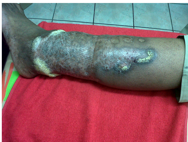
Figure 1. Verrucous plaque on the lower leg.

A 52-year-old male patient from South Africa presented with a lesion on his lower left leg extending from the ankle to just below the knee that has been present for twenty years. The lesion first developed as a verrucous nodule close to the lateral part of the ankle and gradually enlarged, involving the entire lower leg. Clinical examination revealed a verrucous plaque with an elevated border and central areas of atrophy and scar formation. The patient was otherwise healthy, in an