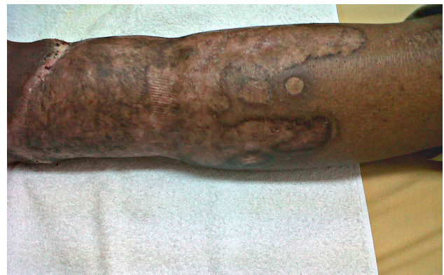
Figure 4. Atrophic scar formation within healing lesions.

Treatment is region specific but often includes systemic antifungal medications such as terbinafine (200-250 mg/day), itraconazole (100-400 mg/day), fluconazole (100-400 mg/day), and/or ketoconazole (200-400 mg/day). Amphotericin B is less effective and is usually used in combination therapy. This patient was placed on 400 mg itraconazole therapy for two months and clinical improvement was seen in several months (Figure 4). The infection is difficult to treat and it may be refractory to antifungal therapy. Relapses are common. Treatment is usually prolonged and is performed until negative cultures are obtained [3]. Surgical excision or cryotherapy may be performed in cases of small lesions. Heat has been described to help in healing of the lesions. Portable pocket heaters showed to be effective in killing pathologic fungi, with temperatures higher than 420° C [3].