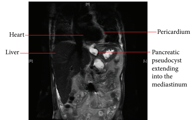
FIGURE 2: MRCP showing cyst extension into the mediastinum.