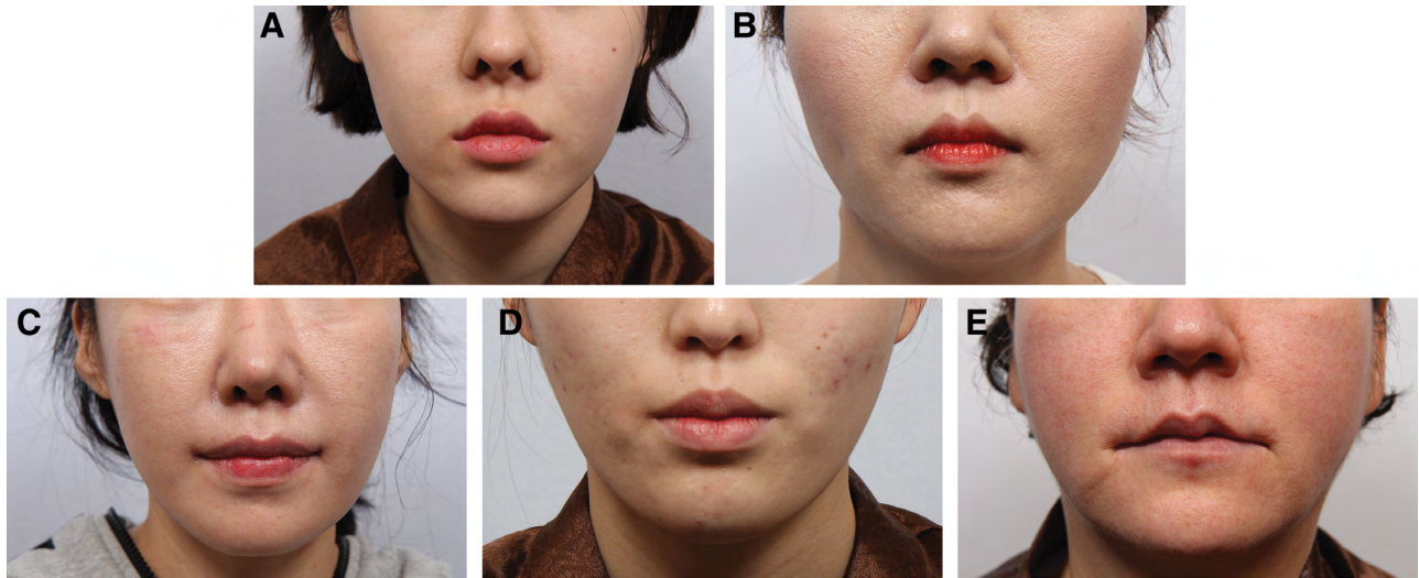
Fig. 2. Clinical photographs for each type of mouth corners. A, type Ia; B, type Ib; C, type IIa; D, type IIb; E, type III.