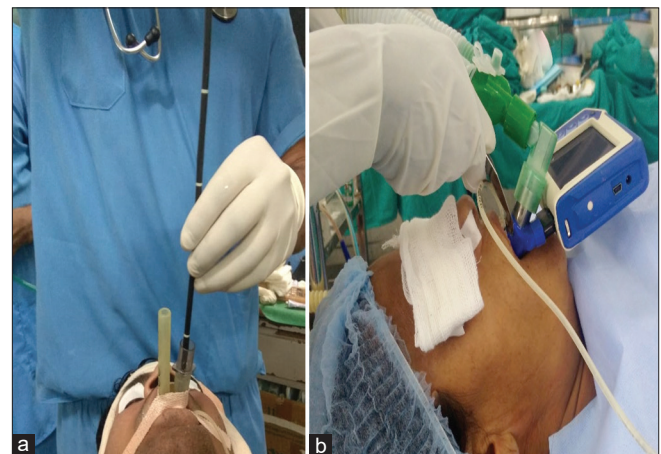
Figure 1: (a) Fibreoptic-assisted visualisation of laryngeal structures (b) LMA CTrach-assisted visualisation of laryngeal structures

In the patients in group FB, the endotracheal tube (ETT) was replaced with a PLMA which was inserted posterior to the in situ ETT by using Bailey's manoeuvre [Figure 1a]. [9] The depth of anaesthesia was maintained using oxygen, nitrous oxide and sevoflurane. Following the replacement, fibreoptic bronchoscope was inserted via PLMA. The grade of laryngeal structures visualised was recorded [Table 1], and the vocal cord movement was shown to the