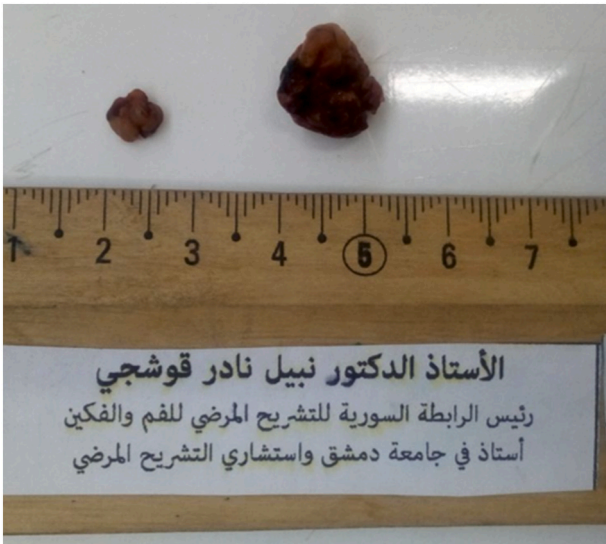
Fig. 2. Clinical view of the lesion after excision.