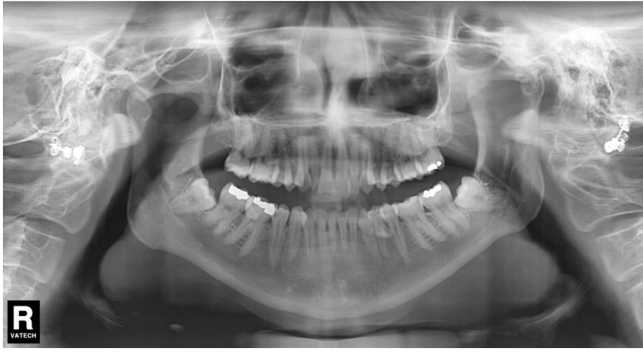
Fig. 1. Panoramic radiograph: the lesion does not appear clearly and definitively.