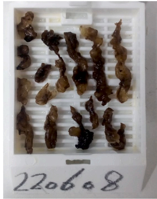
Fig. 3. The stage of cutting and preparing the wax block.

To make a final diagnosis, the sample was fixed in formaldehyde solution and sent directly to oral maxillofacial pathology service for histological examination. Microscopically, using traditional staining