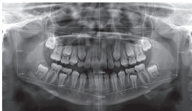
Figure 3 - Lemos asymmetry analysis performed on patient with normal occlusion.

Comparison of measurements revealed considerable discrepancy in the length of mandibular corpus as well as the positioning of the condyles in the patient with posterior crossbite. According to the criteria proposed by Ramirez-Yanes et al, 15 this suggests significant asymmetry. Analysis of measurements demonstrates that patients (crossbite group) had both skeletal (CL) and positional (CHD) asymmetry. At times, even in cases of obvious mandibular asymmetry, it is