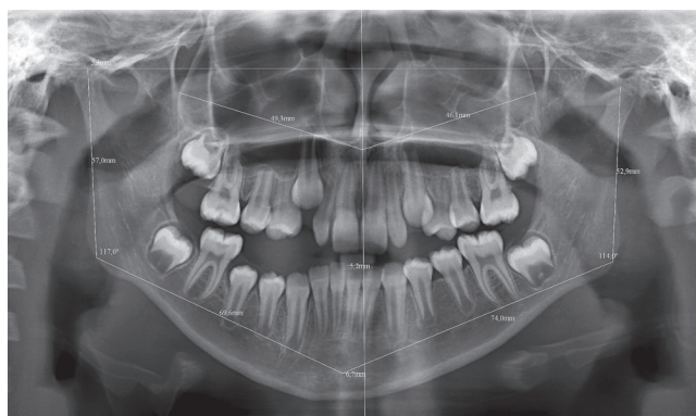
Figure 4 - Lemos asymmetry analysis performed on patient with unilateral (right side) posterior crossbite.

not self-evident whether one side has overgrown or the other has undergrown, 24,25 which underscores the applicability of the analysis proposed herein.