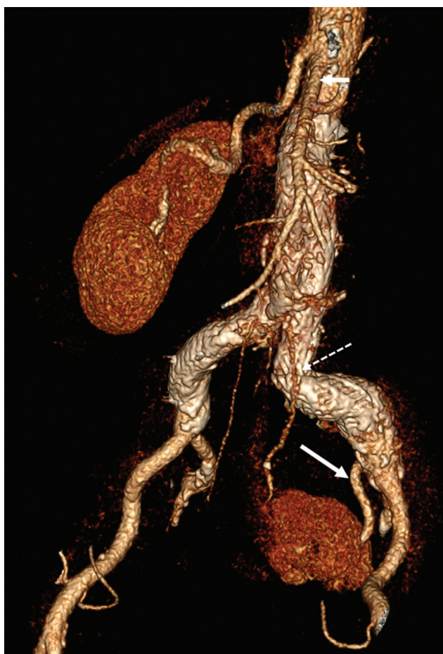
Fig. 3 Three-month postoperative computed tomography angiography depicting the normal flow in the distal left renal artery (LRA; solid arrow). The proximal LRA is slightly opacified, probably via antegrade flow from the Type IIb endoleak (dotted arrow).

Other renal malpositioning configurations include the horseshoe kidney and the crossed fused renal ectopia (CFRE). In two out of six types of CFRE, the fused kidney differs from the CFPK because it lies unilaterally in the lumbar or iliac fossa and the ureter crosses the midline (“lump” or “disc” kidney).