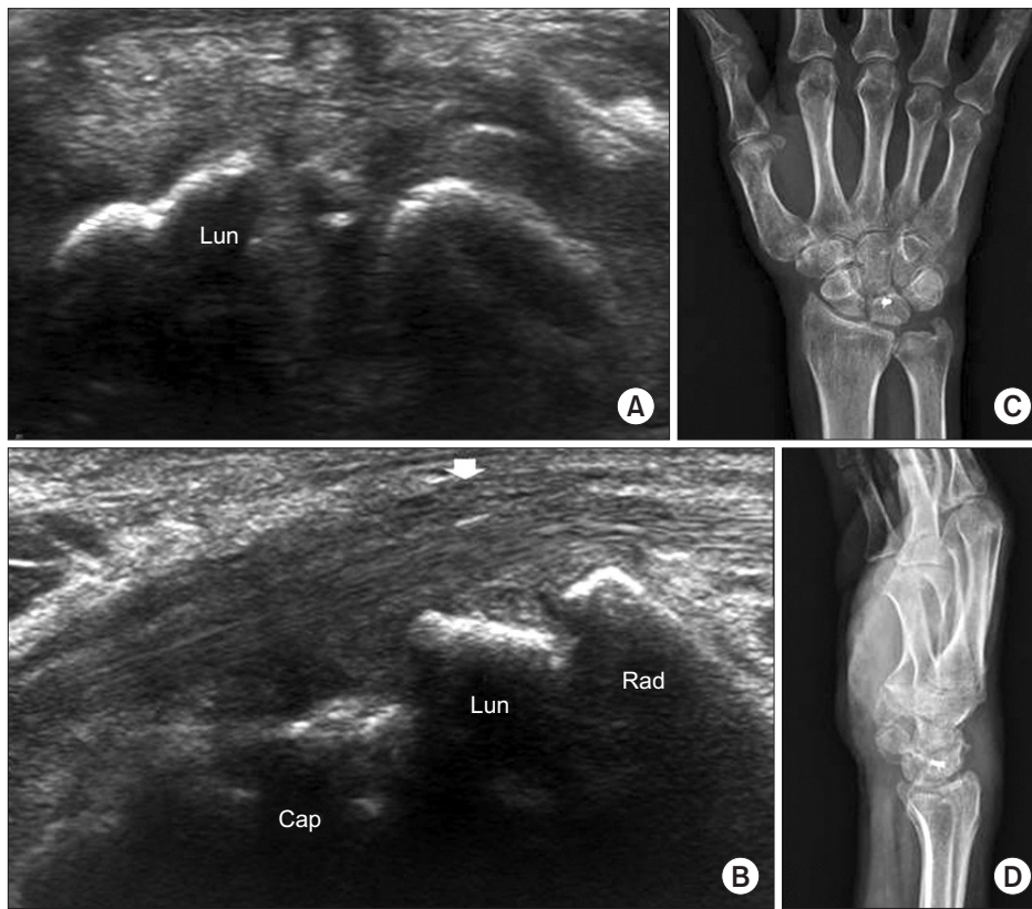
Fig. 4. Ultrasound images (A, transverse; B, longitudinal) and plain radiographs (C, anterior-posterior; D, lateral) at the wrist 1-year post-operation show good carpal bone alignment and a non-compressed median nerve (white arrow).

cation can lead to late complications, including median neuropathy, avascular necrosis, and osteoarthritis of the carpal bone. The reported rate of median nerve injury by lunate dislocation ranges from 24%–45% [7].