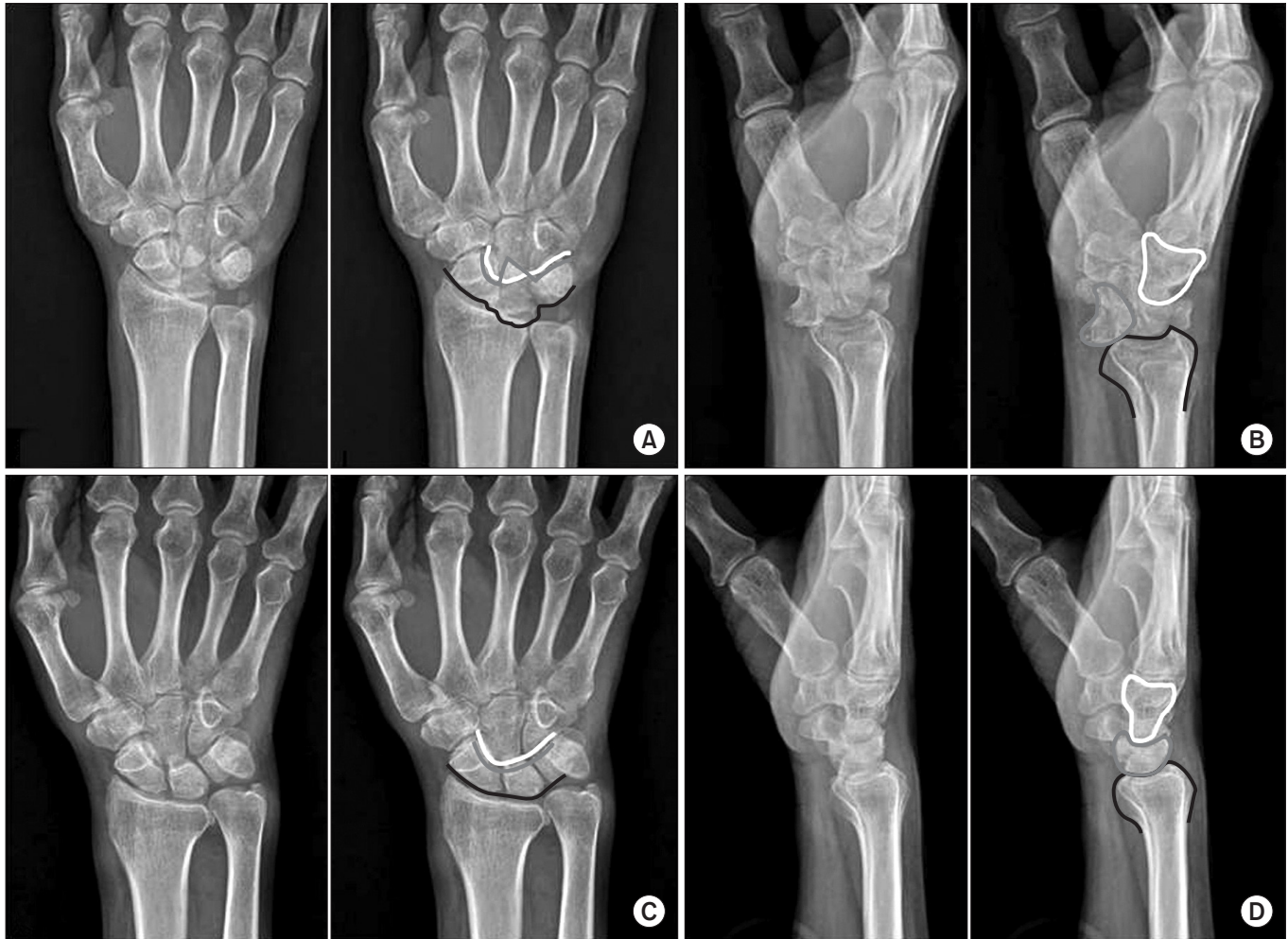
Fig. 2. Plain wrist radiographs of the patient on the symptomatic side (A, B) and the asymptomatic side (C, D). (A) The anterior-posterior view shows a triangular or wedge-shaped lunate bone and a styloid process fracture. In the right image, the ‘arcs of Gilula’ representing the carpal row borders, are illustrated. The black line marks the proximal margin of the proximal carpal row (scaphoid, lunate, and triquetrum). The gray line marks the distal margin of the same three bones. The white line marks the proximal margin of the hamate and capitate bones. The arcs of Gilula are obviously disrupted. (B) The lateral radiograph shows loss of lunate (gray line) and radius bone (black line) collinearity, with the lunate bone tilted volarly and dislocated (the ‘spilled teacup’ sign). The capitate bone is outlined in white. (C, D) Plain anterior-posterior and lateral radiographs of the asymptomatic side show normal arcs of Gilula and alignment of radius, lunate, and capitate bones. The images in (C) and (D) are flipped over the right to the left.