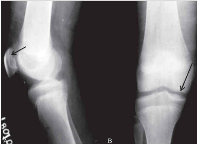
Figure 1 (A, B): Lateral (A) and anteroposterior (B) radiographs of the left knee show patellar beaking in the upper pole and subchondral irregularity involving the articular surface (black arrow in A). Mild flattening of both the femoral condyles is seen (black arrow in B). However the metaphysis and physal plate appear normal

contrast images did not reveal any significant abnormal synovial enhancement.