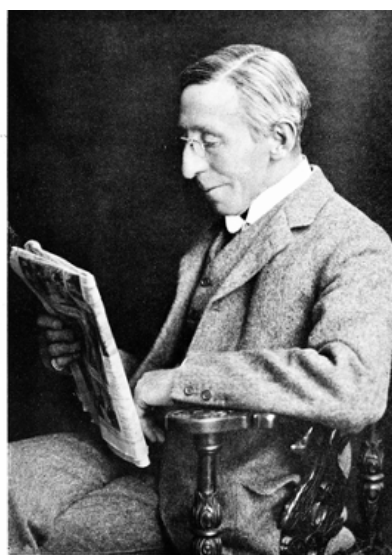
STEPHEN PAGET, M.A., F.R.C.S. (Founder of the Research Defence Society).

Stephen Paget's observations were based on more than 700 autopsy reports on patients who had breast carcinomas associated with a high incidence of liver, ovary and specific bone metastases, and a low incidence of spleen metastases. They were subsequently questioned, nevertheless, by James Ewing (1866-1943), who envisaged a mechanism of metastatic discrimination as being mediated by purely mechanical forces and circulatory patterns 4 . This latter view, that a metastasis could be seen as the result of tumor cell emboli becoming lodged in an excessively narrow vasculature, coincided with Rudolf Virchow's (1821-1902)