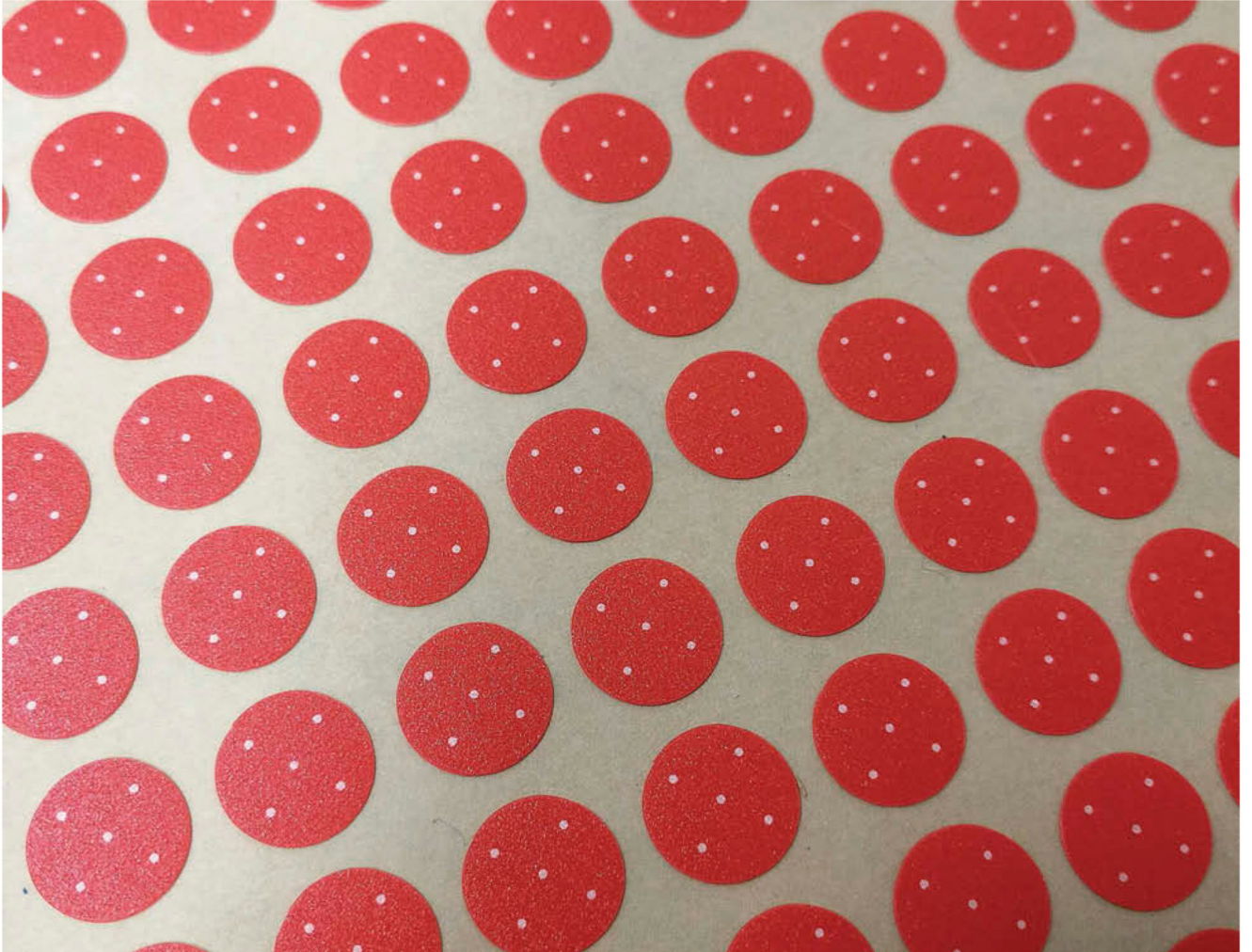
Figure 3. A sheet of follicle size guides. Each sticker bears five dots, each of diameter 0.5 mm.