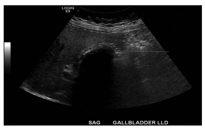
Figure 2: Abdominal ultrasound showing persistence of biliary sludge

ALT: Alanine transferase, AST: Aspartate transferase