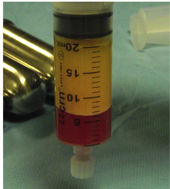
Fig. 1. Lipoaspirate after centrifugation. From top to bottom: First layer of lipids, second layer of fatty tissue, and third layer of blood and local anaesthetics.