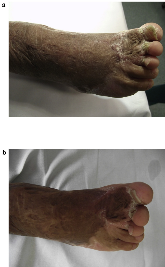
Fig. 4. a. Autologous fat grafting of burn scars. 25 years old patient with a burn scar with a retracted and hypertrophic burn scar. Before treatment with lipofilling. b. 25 years old patient with a burn scar with a retracted and hypertrophic burn scar. After treatment with lipofilling.

dramatic change in this status, making the tissue much more similar to healthy tissues from a histological point of view [93]. In another study, Brongco et al. [94] reported their experience with the use of lipofilling to treat burn scars. They evaluated the evolution of the scars at 1 year after the treatment by means of a questionnaire and physical and histopathological examinations. At the 1-year follow-up, all patients reported an improvement in their clinical condition. The histological findings showed new collagen deposition, neoangiogenesis, and dermal hyperplasia in the context of new tissue, demonstrating tissue regeneration. Clinically, improved texture, softness, thickness, colour, and elasticity of the treated skin were observed, as was a reduction in scar retraction [94]. Conversely Gal et al. [95] treated eight burned pediatric patients with a single autologous fat transplantation and did not observe any scar improvement when compared to a control group treated with saline injections. The authors theorized that their findings may be explained by the fact that they performed only one single session of fat grafting. Indeed Strong et al. [36] theorized that serial fat transplant sessions may be required to improve scarred recipient sites.