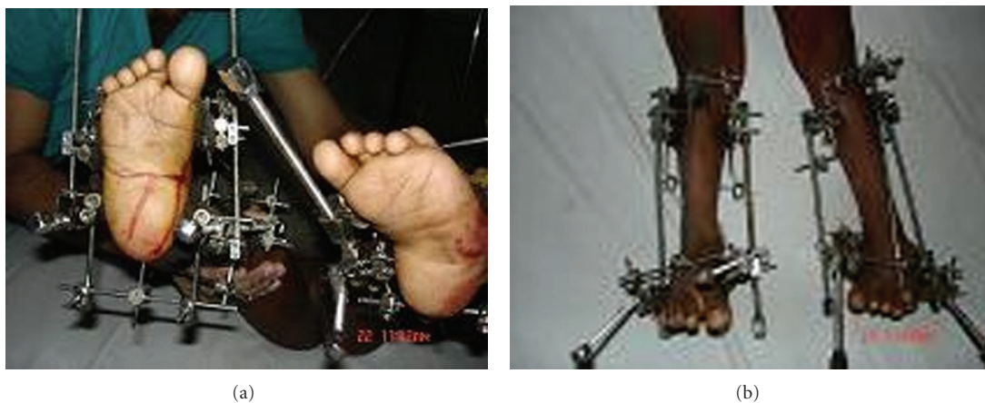
FIGURE 3: Clinical photos showing the fixator assembly in position before ligamentotaxis is started.

average difference in the calf size of affected side and normal side was 1.0 cm while the calf size was same in bilateral cases. The calf size remain unaffected by the procedure.