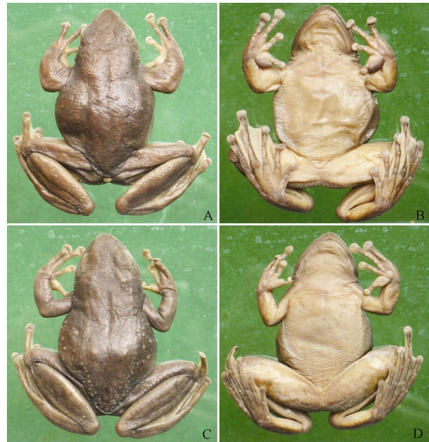
Figure 1 Holotype and allotype of Amolops xinduqiao sp. nov.

Allotype : CIB 80I0696 (Figure 1 C, D), adult female, same locality and date as holotype.