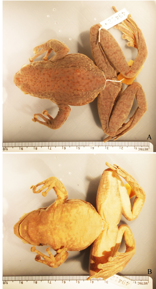
Figure 6 Holotype of Amolops kangtingensis (No. 49412, female)

Amolops kangtingensis was described by Liu (1950). Based on the original designation, the holotype (Figure 6) is a female from “Kangting (=Kangding), Sikang (now part of Sichuan), 8 000 feet (~2 400 m)”, with catalogue number 49412 in the Chicago Natural History Museum (now Field Museum of Natural History), and corresponding to field number 582 (from the collection database of the Field Museum). The holotype (No. 582) measurements were provided in the measurement table on page 351 (Liu, 1950), with body length 74.0 mm. Liu (1950) designated 29 paratypes, with the localities and altitudes provided, including: (1) 16 males, five females, and two young individuals collected with the holotype from Yalakou (=Yalagou) inside Kangting City (with three males and four females measured); four specimens from Tatu River (=Dadu River, altitude 4 500 feet (~1 370 m)) of Luting (=Luding), with the 27 frogs representing A. kangtingensis (= A. mantzorum ); and (2) two paratypes from Chuwo (=Zhuwo, altitude 11 000 feet (~3 350 m)) of Luhohsien (=Luhuo) and Hsintuchiao (=Xinduqiao, altitude 11 200 feet (~3 410 m)) representing A. xinduqiao sp. nov.