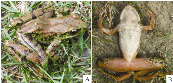
Figure 5 Topotype of Amolops mantzorum , Baoxing, Sichuan

Amolops xinduqiao sp. nov. further differs from A. lifanensis by having a distinct tympanum (v.s. tympanum indistinct); differs from A. loloensis and A. viridimaculatus by having no large brown or green spots on dorsum (v.s. large brown spots on dorsum in A. loloensis , large green spots on dorsum in A. viridimaculatus ); differs from A. mantzorum by different dorsal coloration and pattern, dorsum brown, with irregular green spots, or dorsum green, with reticulate black-brown spots (v.s. dorsum brown, with a few large green blotches (Figure 5)) (Fei et al., 2009b).