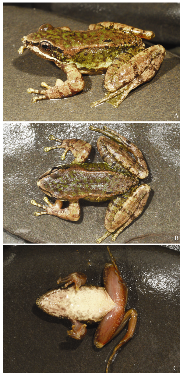
Figure 2 Adult male Amolops xinduqiao sp. nov. (paratype, KIZ014127)

Coloration of paratype in life (KIZ 014127, adult male) (Figure 2; Figure 4A, B): Dorsal head and body brown, with irregular small green spots; lateral head black, edge of upper lip black, white stripe from tip of snout to anterior joint of shoulder; upper part of lateral body green, with indistinct black spots, lower part of lateral body white, with black spots and large blotches; dorsal side of limbs light brown, with black transverse bands. Ventral head and body cream-white, irregular dark gray