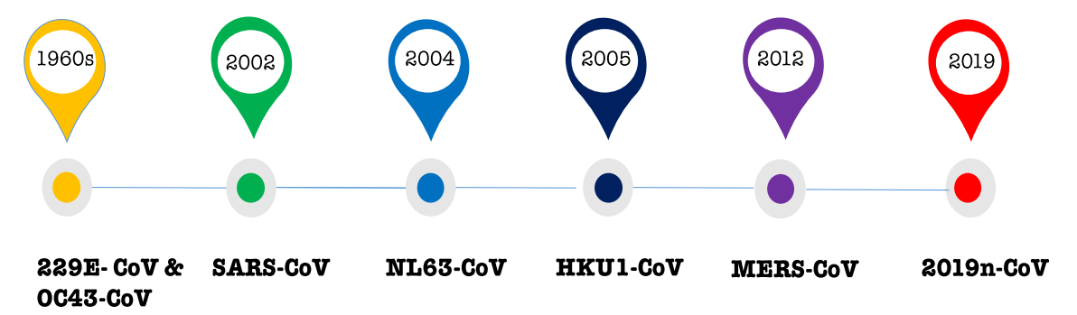
Fig. 1. The timeline of identified HCoVs that have infected people (CDC, 2020).

clinical and pathological features, laboratory characteristics, prevention measures and current developments in the treatment of MERS and COVID-19.