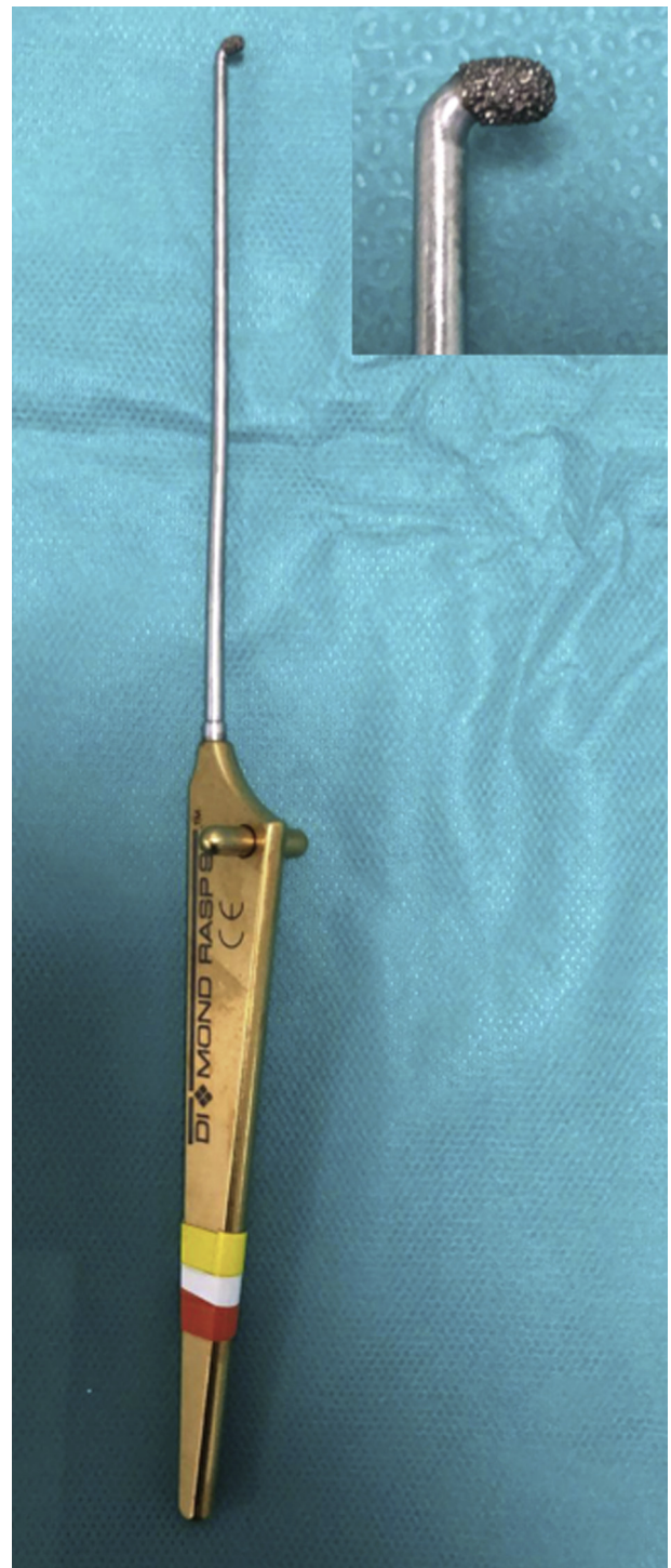
Fig 1. The ACUFEX meniscal diamond rasp (Smith & Nephew, Andover, MA).

For tears affecting the posterior half of the body or the posterior horn, a first stitch is placed in the capsule right above the meniscus. It is important to feel the capsule when it is penetrated to realize about its ability to hold the meniscus sutures. Once the anchor is deployed, a second one is placed in the capsule just inferior to the meniscus and circumferentially surrounding the meniscus tear segment/s. Before tightening the suture, a probe is helpful to position the meniscal torn segments in the desired position and then a final tightening is performed. If a “bucket-handle” meniscal tear is faced, it is helpful