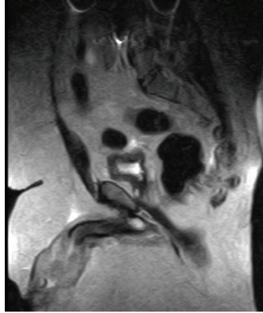
FIGURE 1: Coronal section of MRI showing the corporal bodies leading to a large mass buried within the suprapubic fat pad.