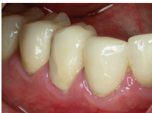
Fig. 3. Grade 2 of a zirconia full-coverage crown (Tooth 44).

Factors that reduce the strength of porcelain-veneered zirconia-based restorations and so increase the risk of chipping are: