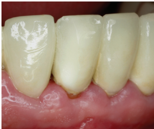
Fig. 2. Grade 1 Chipping of a zirconia full-coverage crown (Tooth 41).