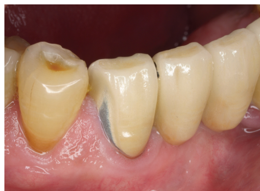
Fig. 1. Chipping of ceramic veneer on ceramo-metallic restoration.

Clinical studies have revealed a high rate of fracture for porcelain-veneered zirconia-based restorations that varies between 6% and 15% over a 3- to 5-year period. These are high values compared to the 4% fracture rate shown by conventional metal-ceramic restorations over 10 years (6) (Fig. 1). The cause of these fractures is unknown but might be associated with bond failure between the porcelain-veneered and the zirconia structure (7).