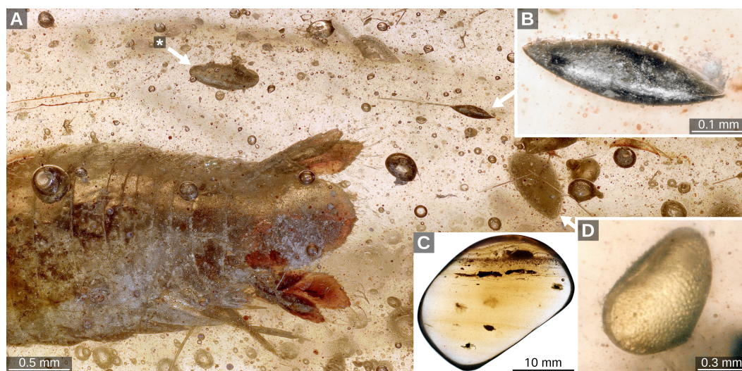
Figure 1 (A) Overview image depicting the relative position of the ostracods (white arrows); (B) Taxon B with numerous vesicles at or right above the lateral pore canals; (C) overview image of the amber piece. (D) Taxon C; asterisk: Taxon A.

Full-size DOI: 10.7717/peerj.10134/fig-1