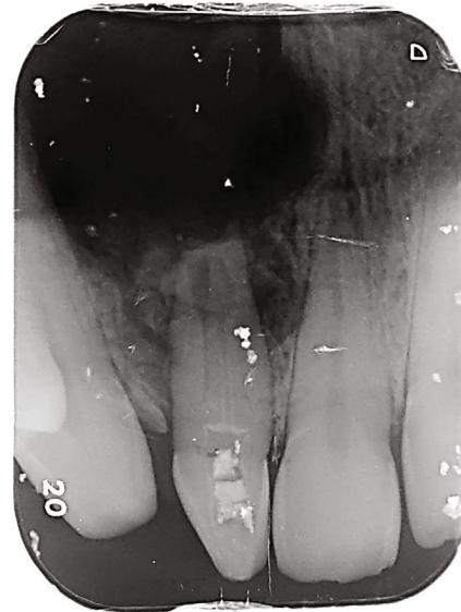
FIGURE 3: Preoperative radiograph showing a complex root canal configuration corresponding to that of type II DI associated with a large extending periapical image in relation to tooth #12.

After obtaining the patient's informed consent, a rubber dam was applied, the access cavity was modified, and the root canal and the invagination were located. The working length was measured using an apex locator and confirmed with an X-ray examination. Both the canal and the invagination were instrumented through a crown-down technique using manual instruments. In order to overcome the lack of mechanical instrumentation in the presence of complex root canal anatomy, all attention has been paid to chemical disinfection. Irrigation used was 2.5% Sodium Hypochlorite (NaOCl) for a total time of 30 minutes for the root canal and the invagination. NaOCl was conveyed into the canal using an irrigation syringe with a side outlet needle, the solution was renewed regularly. To improve disinfection, sonic activation was