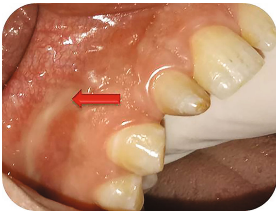
FIGURE 2: Drainage of pus from the vestibular fistula proximal to the apical area of tooth #12.

apex, associated with a radiolucent lesion in the periapical area of tooth #12 (Figure 3). Cone Beam Computer Tomography (CBCT) scan showed the presence of type II invagination communicating with the root canal and revealed a large periapical radiolucency related to tooth #12 (Figures 4 and 5). The diagnosis was chronic apical periodontitis related to tooth #12 with an infected DI type II. The treatment plan was to perform an orthograde endodontic treatment.