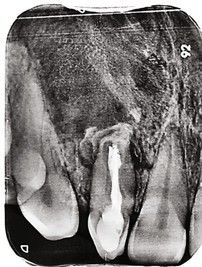
FIGURE 6: 18-month follow-up radiograph showing signs of bone neoformation.

Root canal can be instrumented with manual or rotary files while it is recommended to shape the invagination with manual instruments to prevent the occurrence of instrumental fractures with rotary files within the invagination since the surface is predominantly covered by enamel and has varying shapes [4]. The use of XP-endo Finisher was also reported to shape the root canal in a maxillary lateral incisor presenting type II [8]. In the present case, both the root canal and the invagination were shaped with hand NiTi endodontic instru-