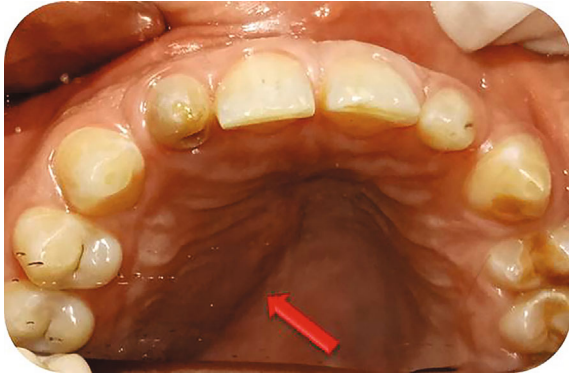
FIGURE 1: Preoperative photograph showing a palatal swelling on the right side.