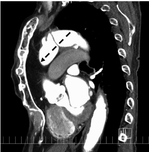
FIGURE 1 Preoperative CT shows funnel chest of the lower part of the sternum and limited space between the sternum and omentum (black dotted arrow)

Considering his coexistent comorbidities, CABG with resternotomy was scheduled. Partial cardiopulmonary bypass was established through the right subclavian artery and right femoral vein for safe resternotomy by decompression of the cardiac volume. Resternotomy was safely performed using a circular electric sternum saw. The omentum functioned as a cushioning material between the sternum and mediastinal organs and appeared viable (Figure 2A); then, the left internal mammary artery was harvested. The space above the ascending aorta for proximal anastomosis, shown in Figure 2B, was dissected using an ultrasonic scalpel (Harmonic Scalpel®; Ethicon Endo-Surgery). The degree of adhesion in the pericardium was not severe; therefore, the targeted coronary arteries were easily detected. On-pump beating CABG was then performed using the left internal mammary artery to left anterior descending artery and saphenous vein grafts to obtuse marginal branch and distal site of the right coronary artery (Figure 2B). After proximal anastomosis of the