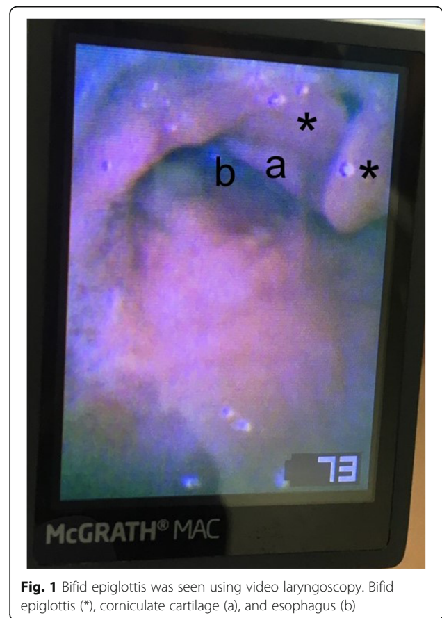
Fig. 1 Bifid epiglottis was seen using video laryngoscopy. Bifid epiglottis (*), corniculate cartilage (a), and esophagus (b)

pressure ventilation. Because we needed to investigate the patient's airway for future surgery, we observed the epiglottis and vocal cords using a McGRATH MAC video laryngoscope with an X-blade (Medtronic, Minneapolis, MN) and confirmed the bifid epiglottis (Fig. 1). A laryngeal mask airway (size 2.5) was inserted, and the cuff was inflated with air (10 ml). We evaluated the vocal cords and trachea using fiberoptic bronchoscopy and visualized the subglottic stenosis (Fig. 2, video). The subglottic stenosis was the reason that only a small-sized endotracheal tube could be inserted when the patient was 11 years old. Anesthesia was maintained by sevoflurane 2.5% and remifentanyl (0.2–0.5 µg/kg/min) and intermittent doses of rocuronium. The operation time was 27 min. For postoperative analgesia, acetaminophen (500 mg) was administered intravenously. After confirming spontaneous recovery of a train-of-four ratio to 100%, we decided not to antagonize the rocuronium, as the patient had multiple allergies and was considered high risk for sugammadex allergy. The laryngeal mask airway was removed after recovery of spontaneous breathing. The postoperative course was uneventful, and the patient was discharged the day after the procedure.