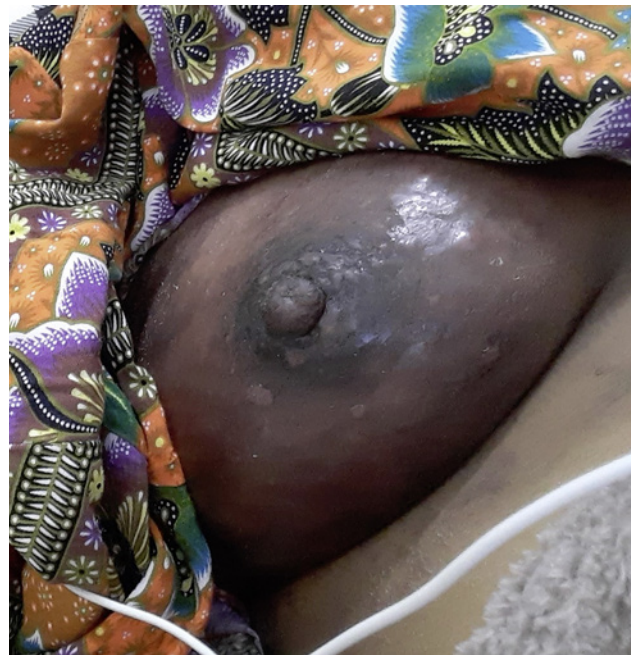
Fig. 3. Picture demonstrating the inflammatory breast changes on patient presentation. Inflammatory breast cancer from metastatic ovarian cancer.

lymph nodes and hypercalcemia. Her right breast and right axillary lymph node biopsy was done urgently. She had ongoing progressive breast changes of redness, swelling, and skin induration and thickening of the whole breast. Biopsy came consistent with metastatic carcinoma of ovarian origin.