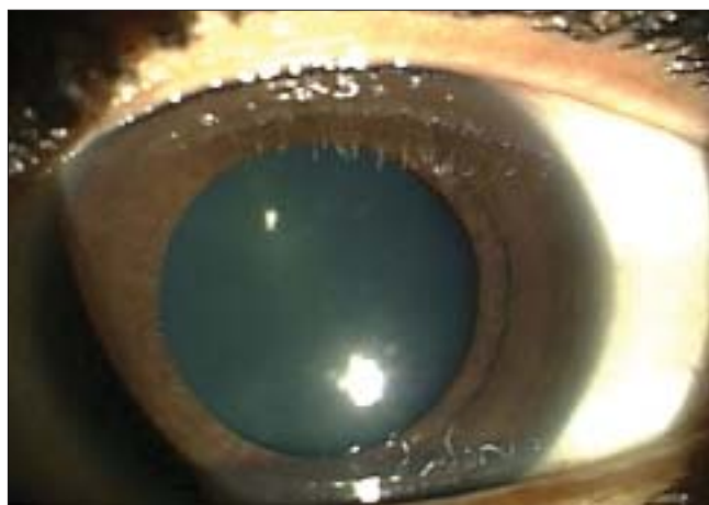
Figure 2: After two weeks of systemic and topical steroids, the inflammation has completely resolved

Several hypotheses have been put forward to explain uveitis after LASIK including the sudden increase and decrease of intraocular pressure following application of the suction ring which simulates the effects following a closed globe injury. [7] Another theory postulates that the shock wave following each excimer application incites inflammation and that the depth of ablation correlates with the inflammatory response. [4] This relation between ablation depth and inflammatory response has not been demonstrated by other authors. [1] Our patient developed uveitis in one eye following ablation for nearly identical refractive error in both eyes suggesting that depth of ablation and number of laser