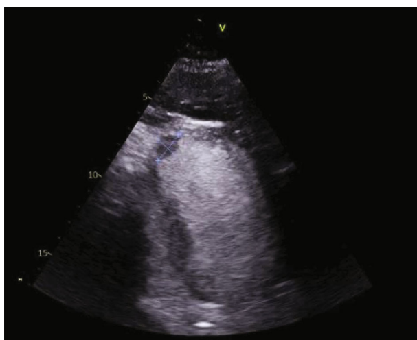
FIGURE 3: Contrast-enhanced transthoracic echocardiogram. Contrast ECHO demonstrating the left ventricular thrombus.

important hematoma postpacemaker or ICD-related procedures with continued compared to interrupted use of DOAC therapy.