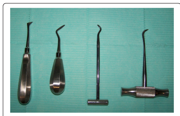
Figure 1 Luxating dental elevators with curved bladed tips to facilitate root extraction.

findings. The patient explained that his mandibular left third molar had been extracted six month previously and that the surgery had been quite laborious and lengthy. Although the healing process had been satisfactory, considerable pain had recently begun in this area. The dental X-ray showed an image consistent with a piece of metal embedded in a subgingival distal caries at the mandibular left second molar (37), which was probably related to a previous tooth impaction process of the mandibular left third molar (38). Two periapical lesions detected at the mandibular left second molar roots might have justified his acute tooth ache due to acute exacerbation (Figure 2).