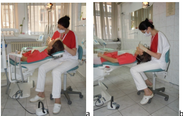
Fig. 2 a,b The frequent deviations from the balanced posture

The frequent unidirectional trunk twisting and tilting is a consequence of a faulty positioning of the tools, equipment and materials. Positioning these useful items at a big distance outside the working area of the dentist (the circular area around the dentist described by the forearms length in his sight) forces him to deviate from the balanced posture. The help of the dental assistant regarding the tools also handing has a major influence on postural deviations of the dentist [14].