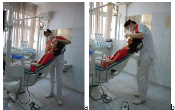
Fig. 3 The orthostatic unbalanced posture

The possible causes of maintaining this posture are: the habitude, the changing resistance, the intensive working rhythm, the feeling of losing some freedom of movements once sitting on the stool and working unassisted or assisted only in part by the dental assistant (the dentist himself takes the tools, which requires moving free in the office space for easy access).