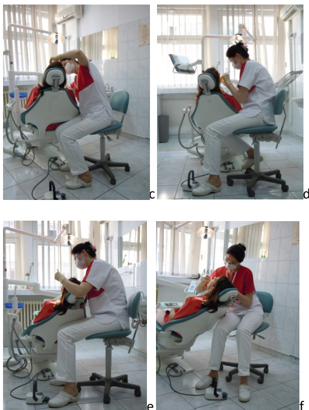
Fig. 4 a-f The seated unbalanced posture