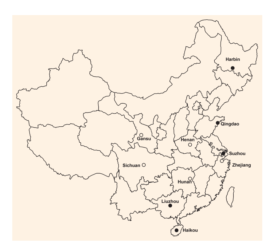
FIGURE 1 Locations of the China Kadoorie Biobank recruitment centres. Black circles represent urban areas, white circles represent rural areas.

The study design and characteristics of the China Kadoorie Biobank population have been described previously [8,9]. A total of 512 891 men and women aged 30–79 years were recruited between 2004 and 2008 from five urban and five rural areas in China (Fig. 1). The areas were chosen according to local disease patterns, exposure to certain risk factors, population stability, levels of economic development, death and disease registry quality and practical considerations, including local capacity and commitment. In each area, permanent residents of 100–150 administrative units (rural villages or urban residential committees) were identified through official residential records, then invited to participate by letter after extensive publicity campaigns. The population response rate was ~30%.