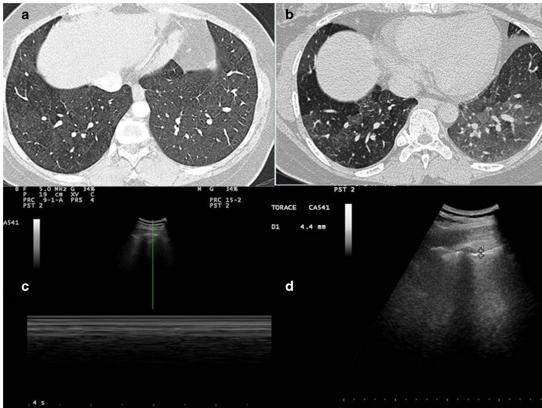
Figure 3. (A, B) HRCT scans show minimal thickening of the bronchial walls and a slightly inhomogeneous appearance of the lung parenchyma (a mild picture of “mosaic oligohemia”). (C) Lack of gliding sign is confirmed by Barcode sign in M-mode with convex probe (5 MHz). (D) Ultrasound imaging with convex probe (5 MHz) shows an irregular thickening of the hyperechoic pleural line (3.1–4.4 mm). HRCT, high resolution CT.

(Figure 3C). Ultrasound imaging, taken with convex probe (5 MHz), shows an irregular thickening of the hyperechoic pleural line (3.1–4.4 mm) in anterior and posterior scan, bilaterally in both the chest walls (Figure 3D). There was not pleural effusion.