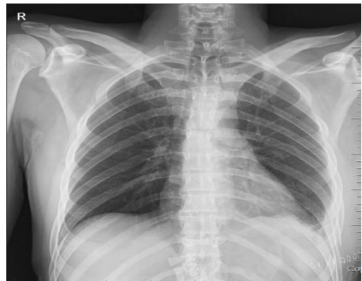
Figure 3: Posteroanterior CXR of the patients after surgery

(NS). A nasogastric tube (NGT) was inserted and fixed that resulted in drainage of about 500cc dark blood. He was sent to cardiopulmonary resuscitation (CPR) room and following cardiac monitoring and continuous pulse oximetry, foley catheter and central venous line (CV-line) were inserted. Blood and fresh frozen plasma (FFP) were prepared and pantoprazole infusion was started. He was candidate for emergent endoscopy for upper GIB. About 3 hours after admission, he had received 3liters of NS 0/9% and had about 2 liters of blood output via NGT. Thereafter