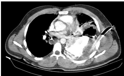
Figure 2: Axial cut of patient's thoracic chest computed tomography with contrast