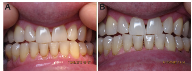
Figure 3 Sixty-two-year-old male. Notes: (A) A3 tooth grade on the eight anterior teeth. (B) Shade change to A2 following 50 minutes of treatment (average tooth shade change of four shades).