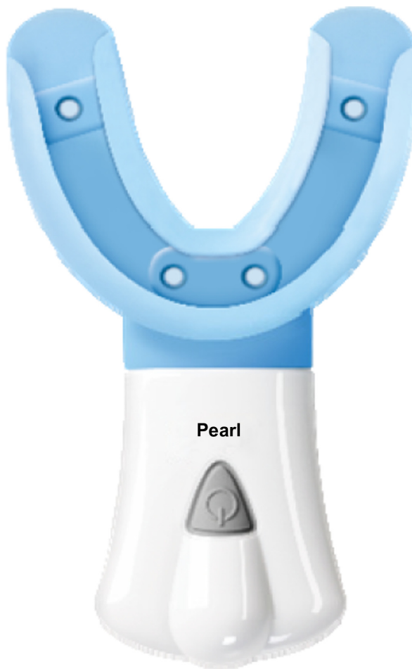
Figure 1 At-home teeth whitening tray (superior arc shown).

Subjects were provided with the at-home bleaching system (Pearl Brilliant White Ionic Teeth Whitening System; Syneron Beauty Ltd., Yokneam, Israel), consisting of a flexible silicone dental tray with superior and inferior arcs (Figure 1) and 20 ampoules of 9% hydrogen