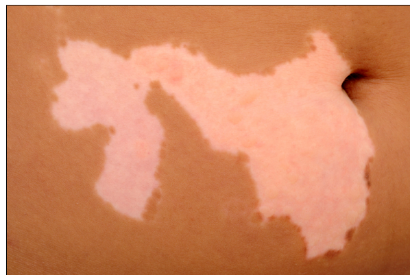
Fig. 1. Well-defined depigmented patches along the right T6~T12 dermatomes.

patches that had initially developed on the right side of her trunk 2 years prior. Physical examination showed well-defined depigmented patches containing white hairs along the right T6~T12 dermatomes (Fig. 1). White accentuation with obvious fluorescence was detected using Wood's lamp. She had received NBUVB phototherapy for 5 months without remarkable improvement. Upon consent, a suction blister epidermal graft was performed. Due to the sizeable lesion, several sessions of epidermal