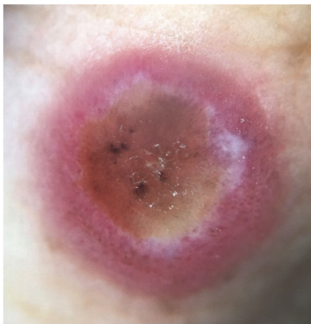
FIGURE 2: Dermoscopy showed an erythematous area, central ulceration, yellow crust, brown dots, a white structureless zone partially surrounding it, and dotted vessels; original magnification x10 (DermLite II Pro 3Gen, San Juan Capistrano, CA, USA).