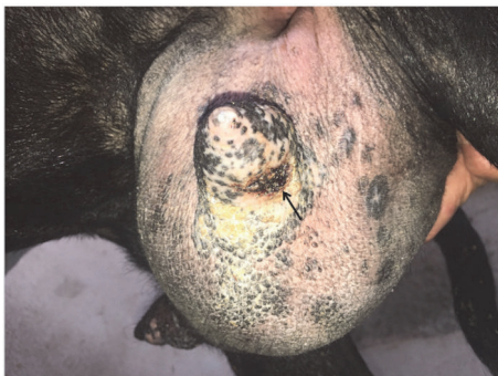
FIGURE 3: (a) Udder lesions (arrow) on the patient's goat.