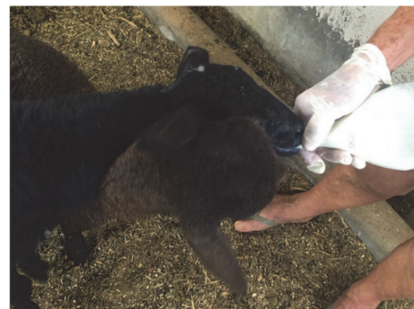
FIGURE 5: Patient feeding the kids using gloves.